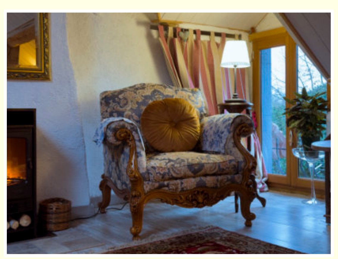
Chez-nous - Les Saumais